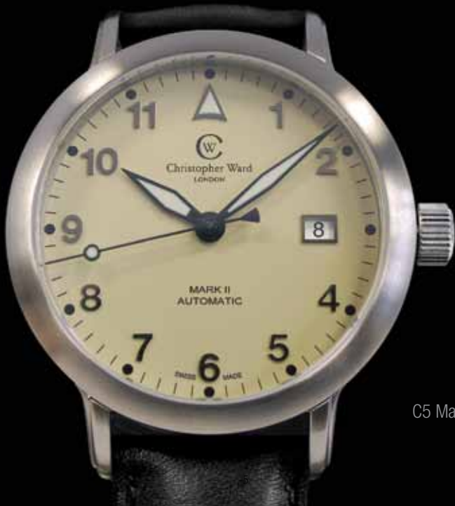
C5 Malvern Aviator MK2