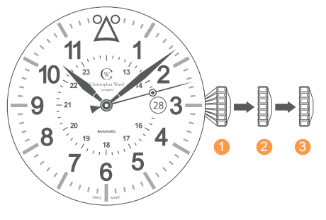
C8 Pilot MKI illustrated