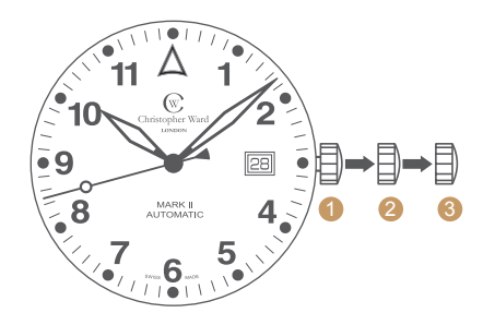
Mark II illustrated