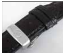
Step 8 Complete