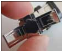
Step 2 Click quick-release