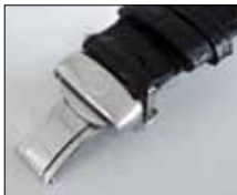
Step 1 Locate the clasp

The strap versions of the C15 Automatic use quick-release butterfly clasps. If you are unfamiliar with the butterfly clasp system just follow our 8 step guide below.