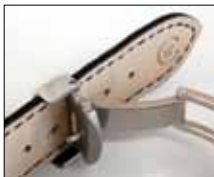
Step 5 Thread strap through