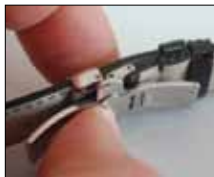
Step 7 Close clasp