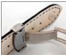
Step 6 Snap back