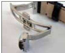
Step 3 Pull open clasp