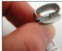
Step 4 Prise cover open